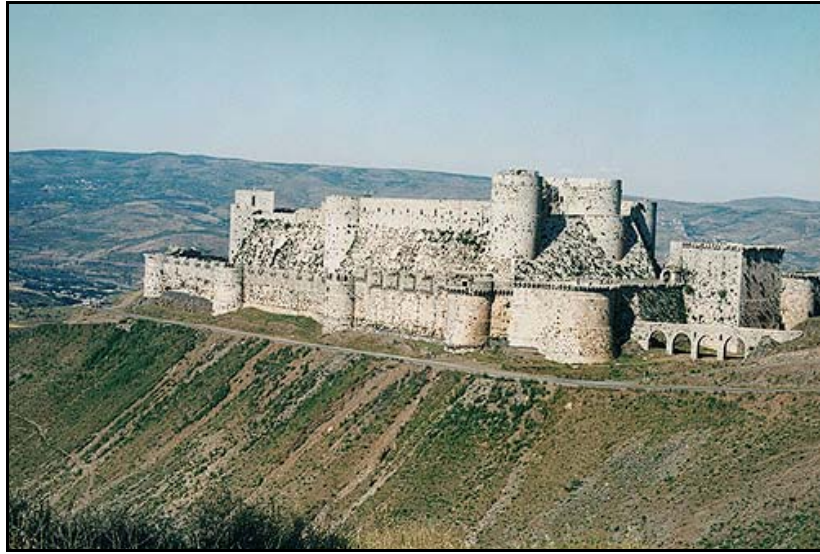
Fortress of the Knights Hospitallers [Catholic military/religious order], Syria, mid-12c